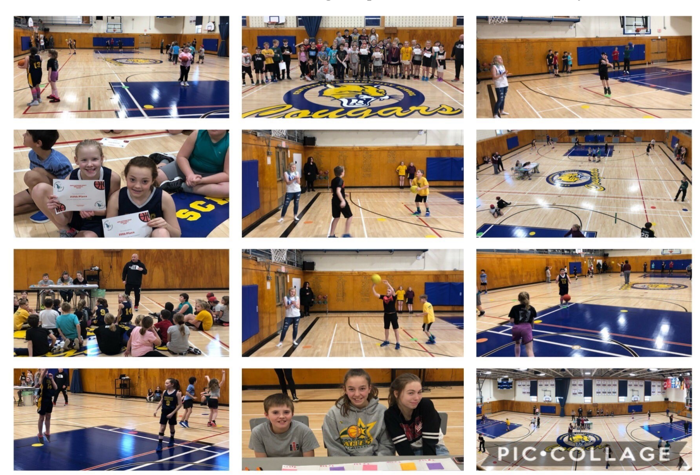
NBA 2 Ball Basketball Shooting Competition, Centerville Community School